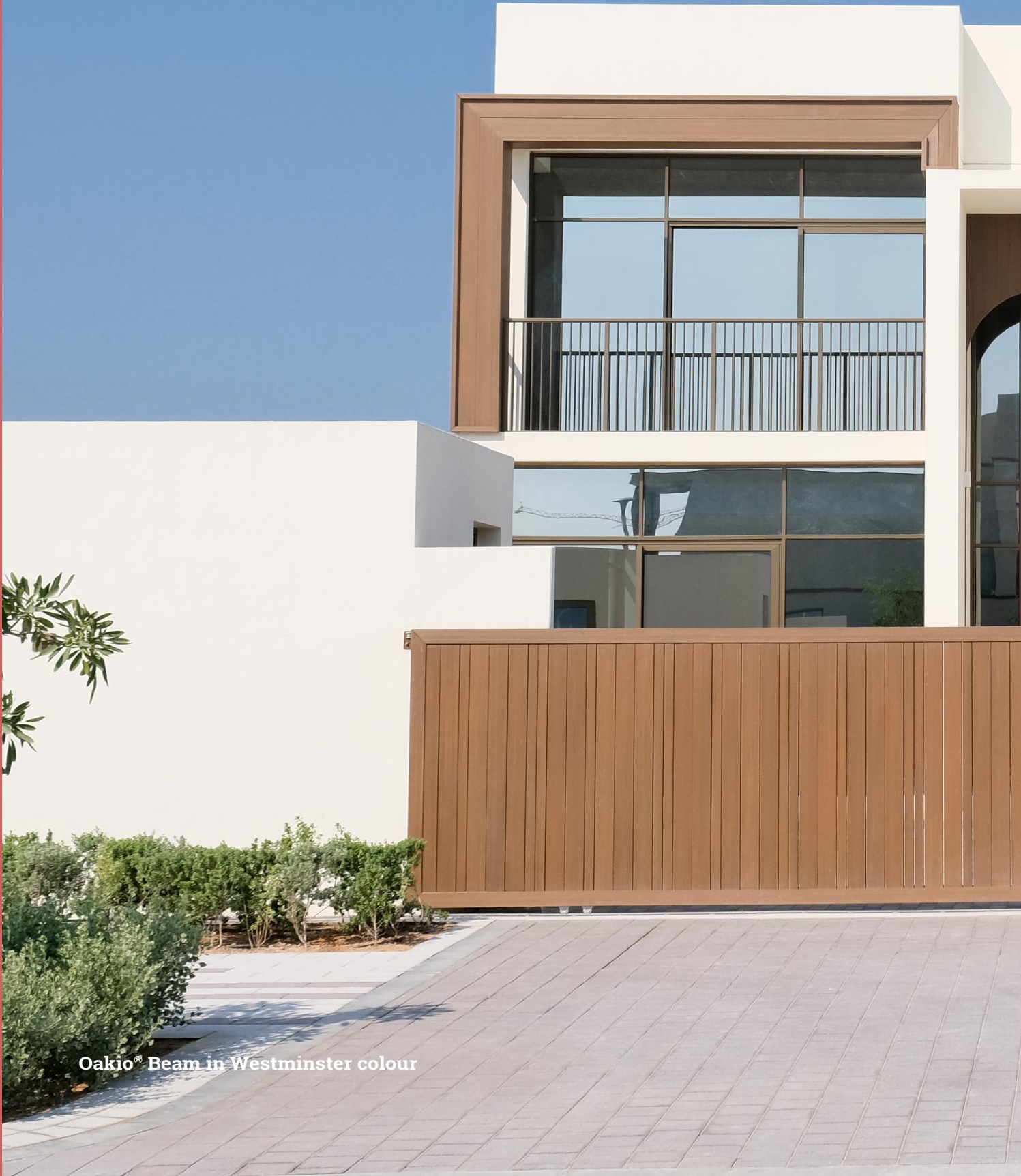
Oakio® Beam in Westminster colour